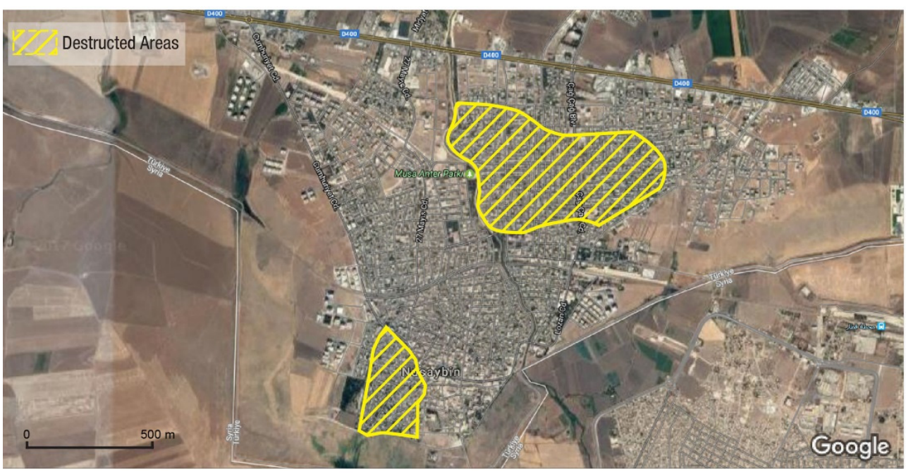
Imagery ©2017 CNES / Astrium, Cnes/Spot Image, DigitalGlobe, Landsat / Copernicus, Map data ©2017 Google