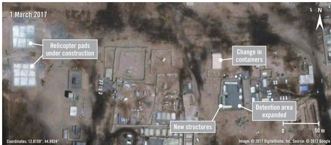
On 1 March 2017, imagery shows the area has been expanded and three new structures are visible. The color and configuration of the containers outside the perimeter has changed, suggesting they were updated or they are new containers. Two new helicopter pads are also under construction.