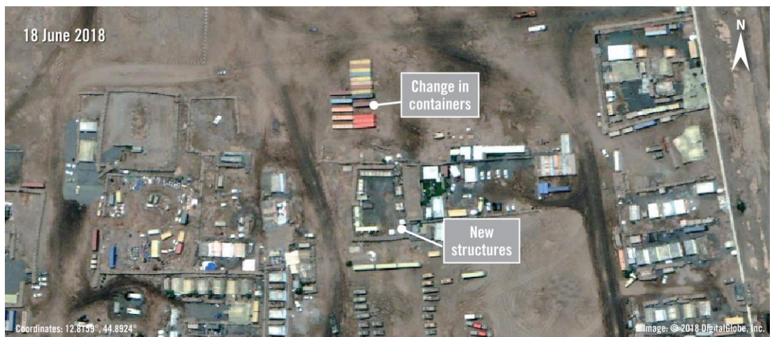
On 18 June 2018, imagery shows a change in the containers and a cluster of new small structures compared to the imagery from March 2017, which would indicate that the facility is likely still being maintained and in use.