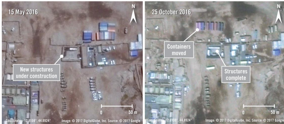
On 15 May 2016, construction of three buildings is visible. Walls of 12 individual rooms with an approximate area of 5m 2 each are apparent. On 25 October 2016, the structures appear complete and containers have been moved nearby, suggesting possible connection with the detention area.