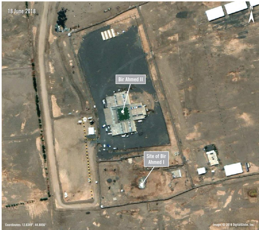
Satellite image from 18 June 2018 shows the site in Aden of the defunct Bir Ahmed I prison and the newer Bir Ahmed II, which became an official detention facility in November 2017.

As the period without news of their disappeared relatives extended into months or even years, families have sought out different ways to obtain information. They have communicated with prison guards on an unofficial basis and have reached out to former detainees who have been released from various informal detention sites to check if they had encountered their missing relatives there. In Aden and al-Mukalla families have been holding protests 69 and have started groups on social networking sites to share information. But that has made them vulnerable to unconfirmed reports, rumors, and false information, exacerbating families' anguish. At one point, a list was circulated on social media with the names of some 20 disappeared detainees rumored to have died in custody.